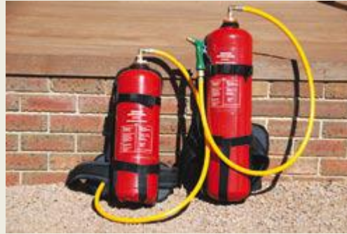
Left: Model BP9 Right: Model BP14 Ergonomic back pack.

lodge themselves within fire fighting equipment, clothing and vehicles. The Ember Attacker is an effective way to protect your home by extinguishing embers after they land.